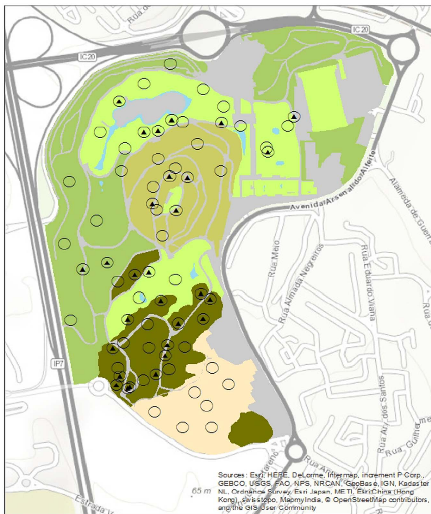
Fig. 1. Map of the studied green space showing the sampling sites (lichen transplant and lichen diversity sites) and the main vegetation types (allotments, original woodland, dense plantations, sparse plantations, irrigated lawns, wetland vegetation). The surroundings are occupied by urban fabric with different densities and large roads (dark grey).